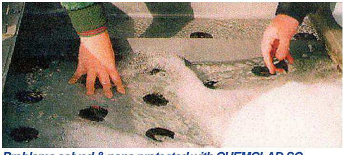
Problems solved & pans protected with CHEMCLAD SC.

700 Hicksville Road • ENECON Center Suite 110 • Bethpage, New York 11714 Toll Free: 888-4-ENECON • Phone: 516.349.0022 • Fax: 516.349.5522 Website: www.enecon.com • Email: info@enecon.com