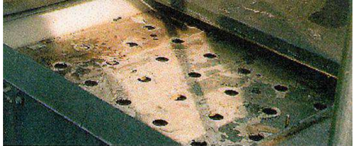
Pool paint peeling on pans poses problems.