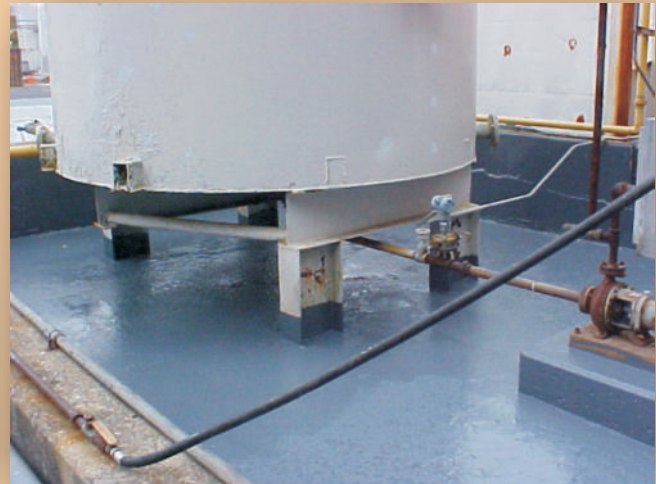
The third containment area was repaired and protected as per the second containment area.