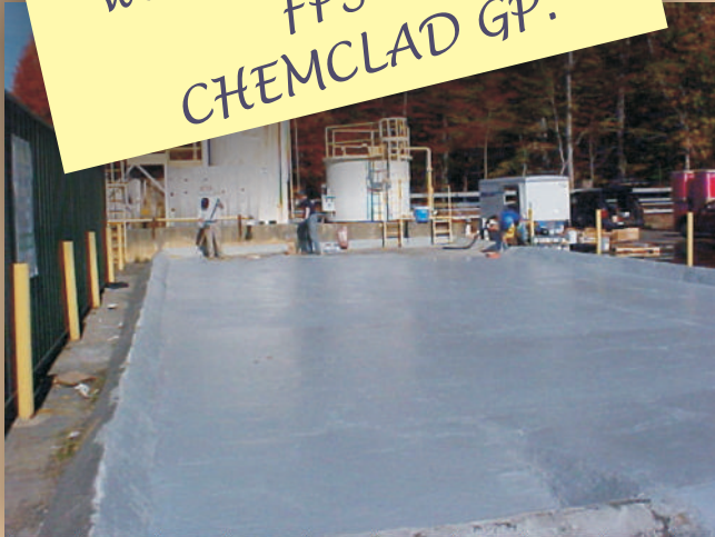
This, the largest of the three areas was first power washed, then abraded with a floor sander; cracks were repaired with ENECRETE DuraQuartz and then coated with ENECLAD FPS.

New Jersey Grout Manufacturer Repairs & Protects Containment Areas with DuraQuartz, FPS & CHEMCLAD GP.