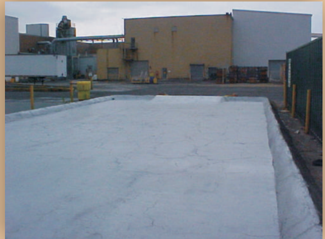
View from the opposite direction. Pallets containing drums of chemicals are stored here.

The ENECON Mid Atlantic Engineering Team completed this entire project in just 4 days to the complete satisfaction of the plant engineers.