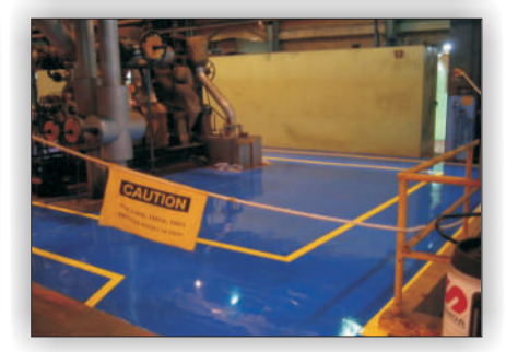
They contacted Australia's Team ENECON who suggested a standard application of ENECLAD FPS in a special blue color. This high performance polymer composite system would provide the plant with the durability - and aesthetics - they were looking for.

The project was completed on time and on budget and the plant engineers are delighted with the results as seen here.