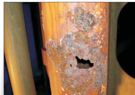
Holes caused by corrosion