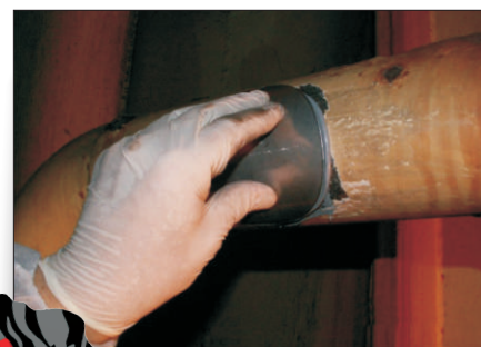
Patch applied to hole