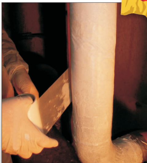
Fiberglass reinforcement tape over 1st coat of ENESEAL CR