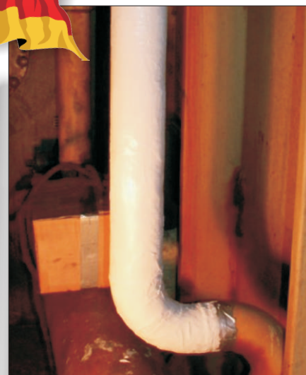
Final coat of ENESEAL CR

6 Platinum Court • Medford, NY 11763 Toll Free: 888-4-ENECON • Phone: 516-349-0022 • Fax: 516-349-5522 www.enecon.com • info@enecon.com