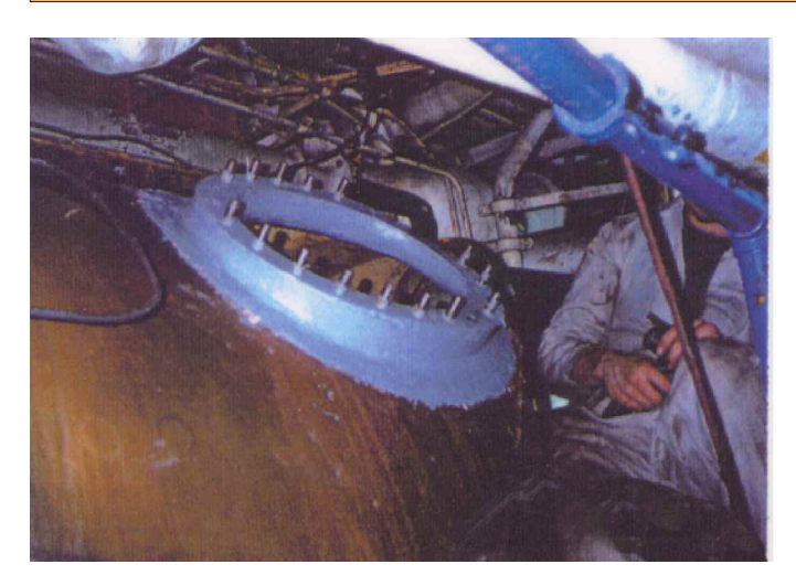
Damage repaired with CeramAlloy CP+